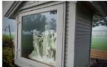
Rosary/Stations of the Cross Walk

More Campaign information; including FAQs can be found on the parish website: https://icc-columbia-il.us/