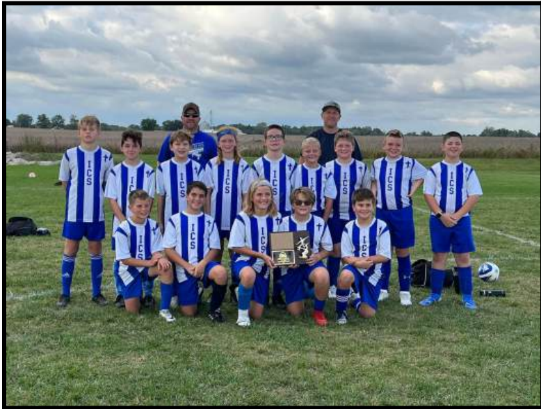
5/6 BOYS SOCCER: Congrats to our 5/6 boys soccer team on their 2nd place finish in the Diocesan Tourney. Special thanks to coach Witges and Coach Oberkfell for your time and dedication to the boys.