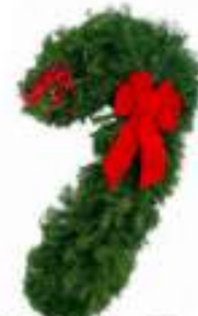
36" Candy Cane Wreath $32