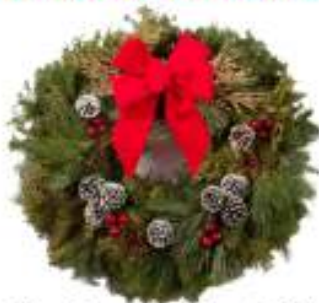
Florist Quality 24" Wreath $45