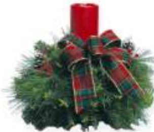
Candle Centerpiece $58