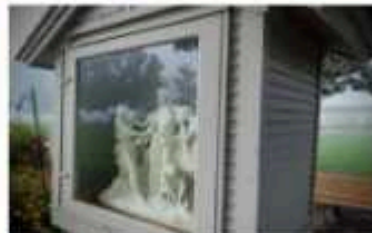
Rosary/Stations of the Cross Walk

More Campaign information; including FAQs can be found on the parish website: https://icc-columbia-il.us/