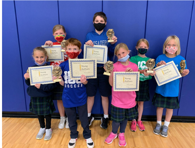
Grades 1 -4 were recognized today.