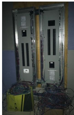
power to the students!