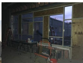
some windows are in