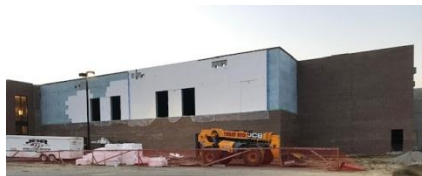
Need good weather

PS GCHS winter baseball camp is Dec 26-28! See attached flyer for information!