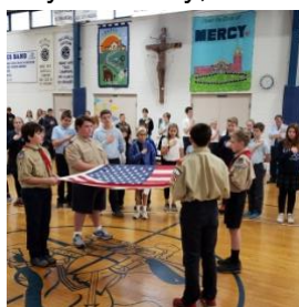
display during the National Anthem