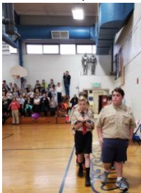
Flag protocol officers