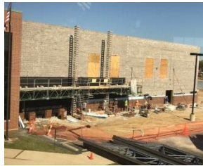
The brick is going up on the lower level.