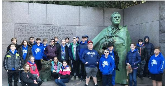
with FDR memorial