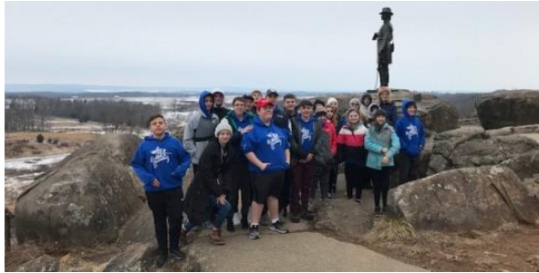
Gettysburg with General Warren