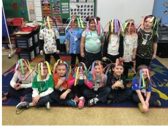
Day 100 = 100 curls!

PS Charles Dickens always slept facing north, believing it improved his creativity. It would have been a tough time to face north this week! But the north sure made Catholic Schools Week special with 2 days off!